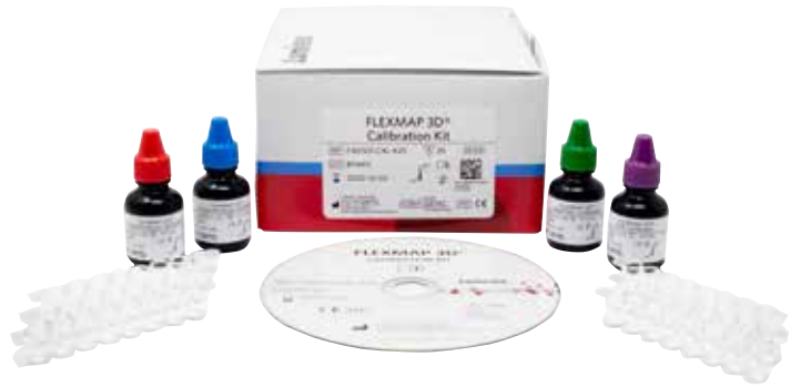
FLEXMAP 3D® Calibration Kit