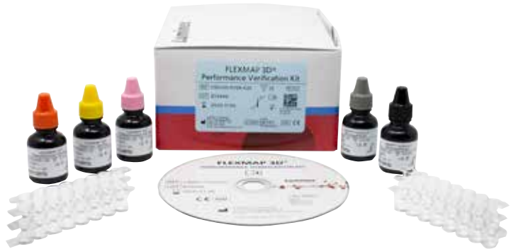
FLEXMAP 3D Performance Verification Kit